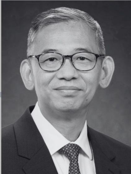
Y M WOO

Commissioner - Independent Commission Against Corruption Hong Kong - China